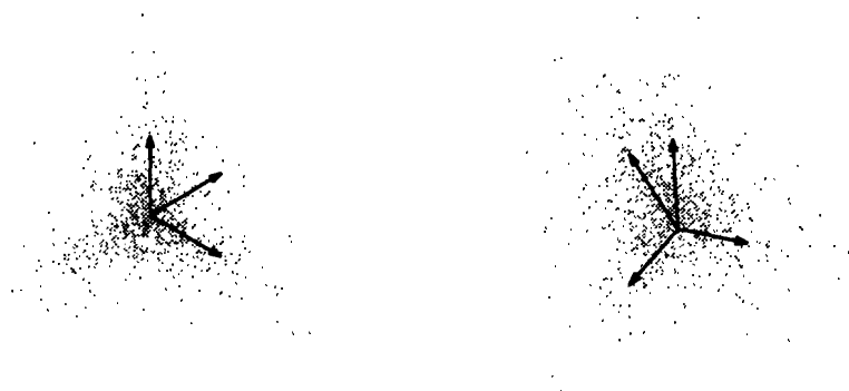
Figure 2: Examples illustrating the fitting of 2D distributions with overcomplete bases. The first example is equivalent to 3 sources mixed into 2 channels; the second to 4 sources mixed into 2 channels. The data in both examples were generated from the true basis \mathbf{A} using \mathbf{x} = \mathbf{A}\mathbf{s} with the elements of \mathbf{s} distributed according to an exponential distribution with unit mean. Identical results were obtained by drawing \mathbf{s} from a Laplacian prior (positive and negative coefficients). The overcomplete bases allow the model to capture the true underlying statistical structure in the 2D data space.

More sources than inputs. In these 2D examples, the bases were initialized to random, normalized vectors. The coefficients were solved using BPMPD and publicly available interior point linear programming package (Meszaros, 1997) which gives the most probable solution under the Laplacian prior assuming zero noise. The algorithm was run for 30 iterations using equation (5) with a stepsize of 0.001 and a batchsize of 200. Convergence was rapid, typically requiring less than 20 iterations. In all cases, the direction of the learned vectors matched those of the true generating distribution; the magnitude was estimated less precisely, possibly due to the approximation of \log P(\mathbf{x}|\mathbf{A}) . This can be viewed as a source separation problem, but true separation will be limited due to the projection of the sources down to a smaller subspace which necessarily loses information.